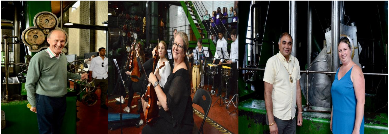
Sir Peter Bazalgette